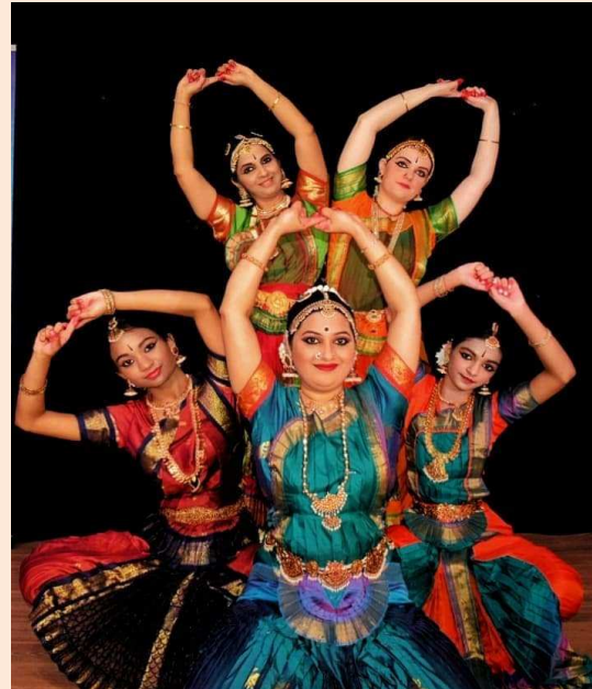
VASANT PANCHMI CELEBRATED IN ASCC